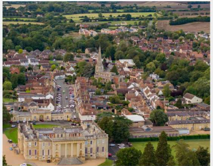
Residents of Kimbolton Cambridgeshire have hired a private security firm after spate of burglaries